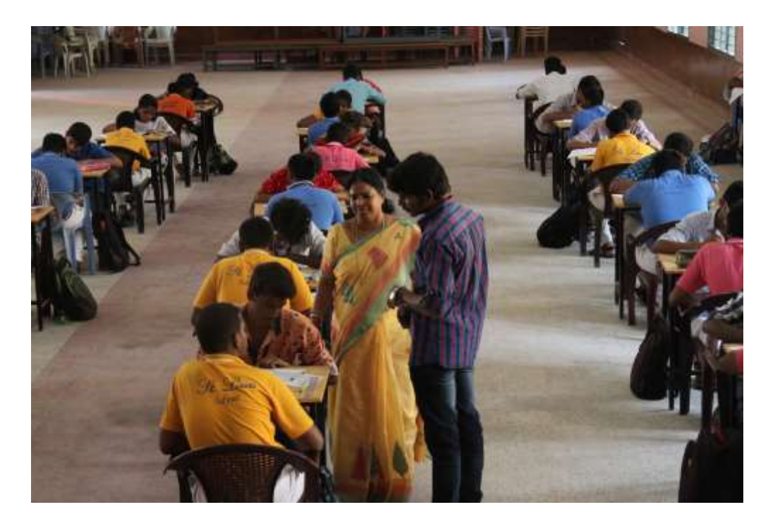
Rotaract members acting as Scribes for St. Louis students

Rotaract Club members volunteered as scribes at St. Louis College for the deaf and the blind. 65 Students from the College write the exams thrice in a year for the students of St. Louis College.