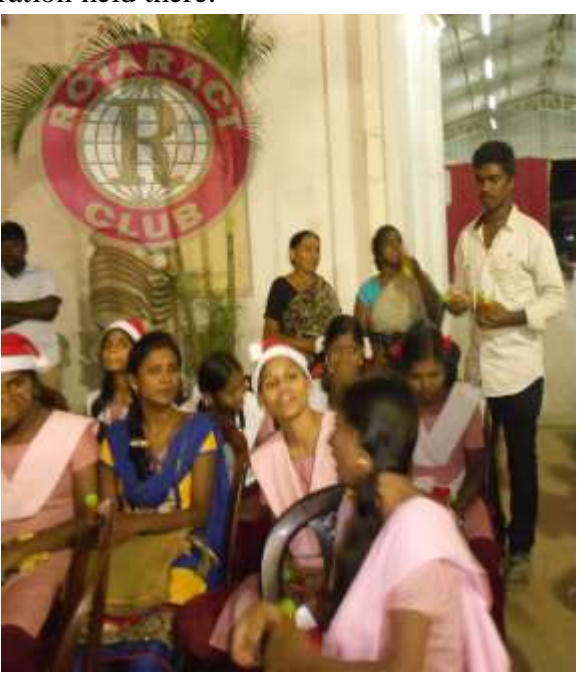
Rotaract member distributing sweets to the Orphan kids

The Rotaract club members visited Good Shepherd Church on 22<sup>th</sup> December 2015 in Mylapore. The club helped 1500 Orphanage children and old people and sponsored food, clothes, provisions during the Christmas Celebration held there.