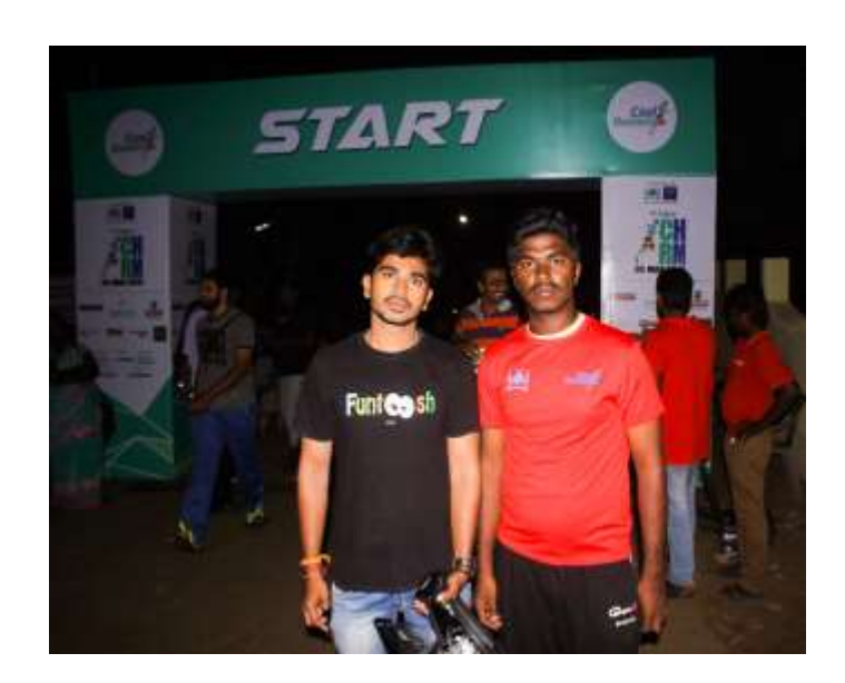
Rotaract member as volunteers for Marathon Cool Runner 2016

The Rotaract Club of the college along with parent club Rotary club, Adyar dist. 3230, the students joined as volunteers for Cool Runner Marathon 2016 on 20<sup>th</sup> March 2016 at YMCA, Nandanam.